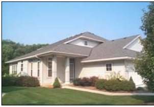
Compare prices and amenities ... You'll want to take a closer look. $218,000