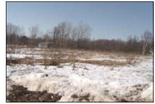
Waterfront Acreage in Saugatuck Township $1,375,000