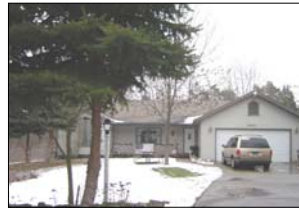
3 bedrooms / 2 baths, master suite w/ cathedral ceilings 2 stall garage.