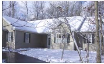
Like new custom home nested in a wooded park like setting ... $295,000